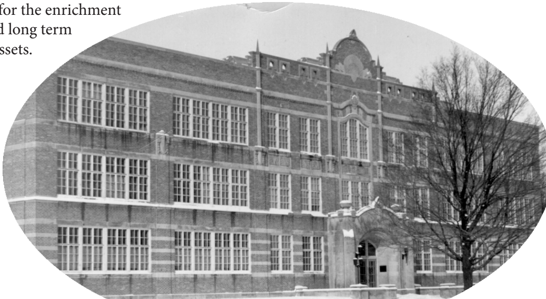
Newberry High School

Gifts will provide funds for the educational enrichment opportunities for our young people above and beyond the normal school district operating budget. Contributions will be placed in a special account administered by the Foundation's board of trustees. The board has established long and short term goals that will allow financial support for the enrichment of current programs and long term growth of Foundation assets.